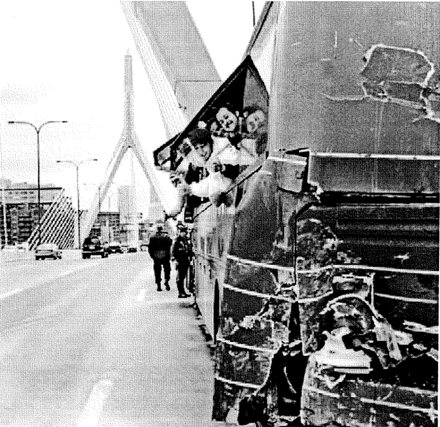
A three bus collision caused delays on the Zakim Bunker Hill Bridge yesterday. Two of the buses were on a field trip from New England College to Boston, the third was a schoolbus.